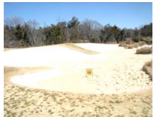
After Bunkertac™ application

On-Course Solutions Blair Atholl Bunkertac™ Application June - September 2009