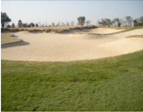
Before Bunkertac™ application