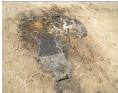
Algae from water ingress