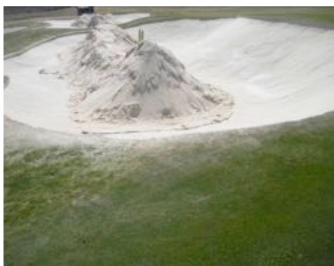
During Bunkertac™ application