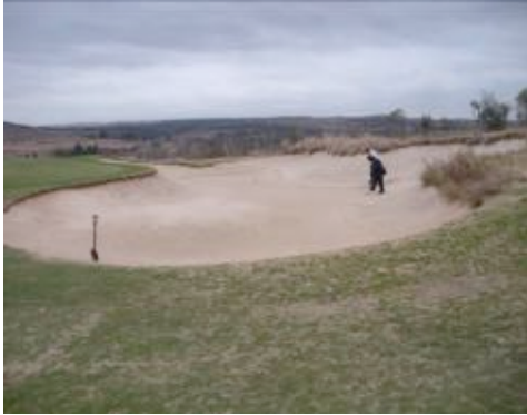
Before Bunkertac™ application