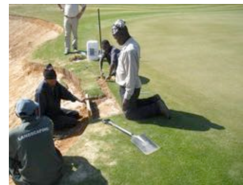
Repair of collapsing edge