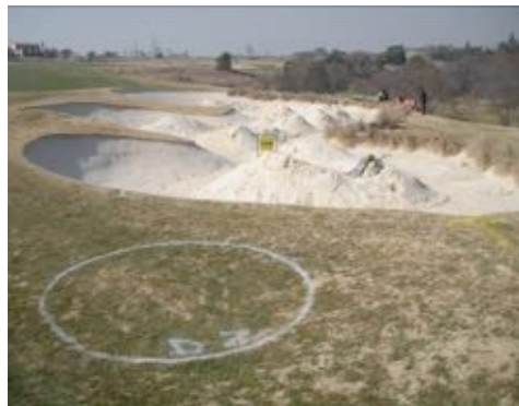
During Bunkertac™ application