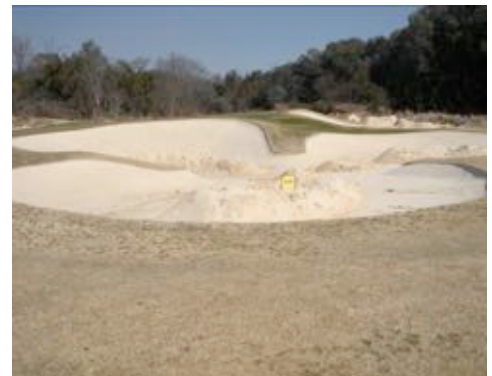
After Bunkertac™ application