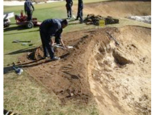
Re-build of collapsing slope