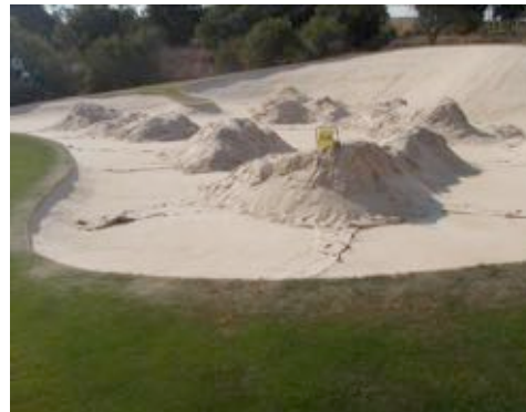
During Bunkertac™ application