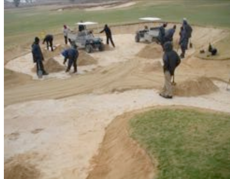
Removal of contaminated sand