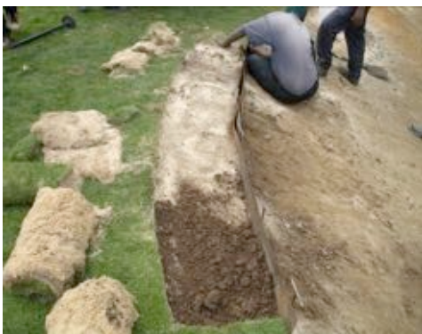
Repair of collapsing edge