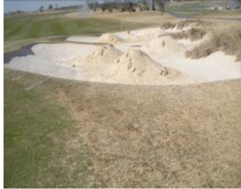
During Bunkertac™ application