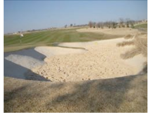
After Bunkertac™ application

During the application process each coat of Bunkertac™ was given sufficient time to penetrate or soak in before applying another coat. In winter this may take up to 24 hours. This will ensure the desired penetration and avoid the formation of a skin or biscuit layer.