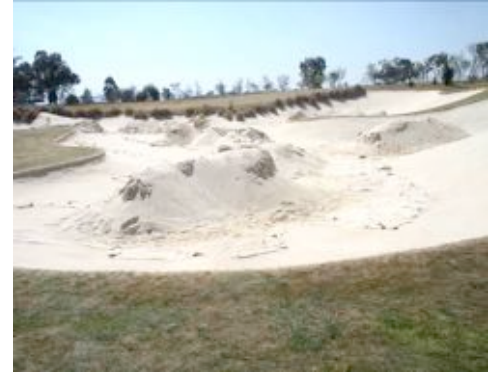
After Bunkertac™ application