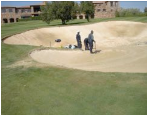
Before Bunkertac™ application