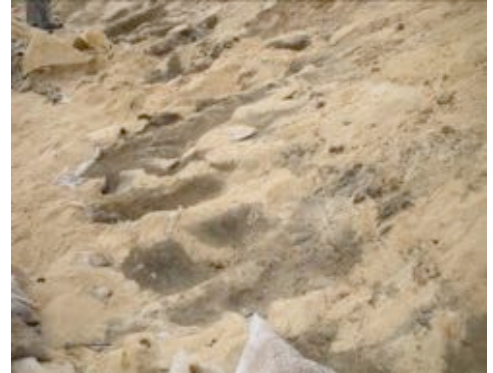
Tire tracks from construction