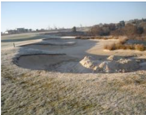
Before Bunkertac™ application