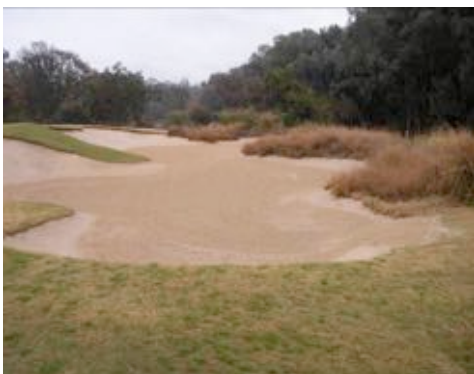
Before Bunkertac™ application