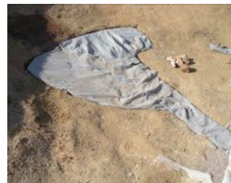
Covering gabion installation on bunker 10