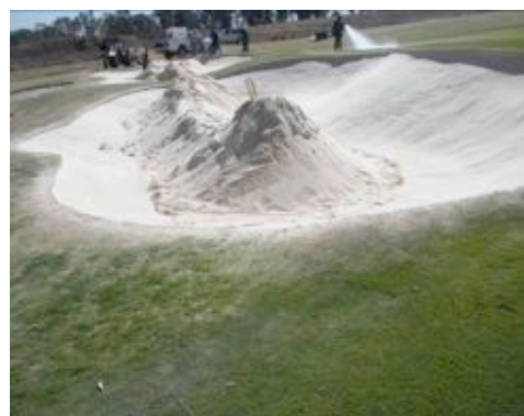
After Bunkertac™ application