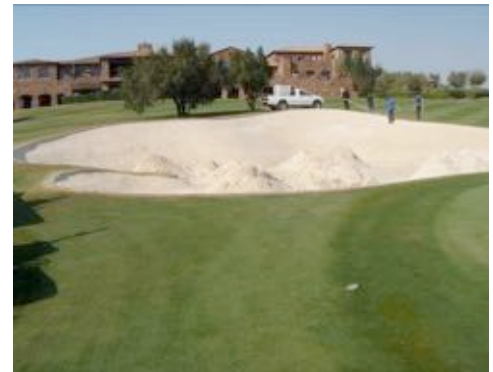
During Bunkertac™ application

Using Bunkertac™ and the application methods developed by On-Course Solutions for stabilization of the edge and face of the bunker, sand flashing and contamination prevention will provide you with not only a more aesthetically pleasing look to your bunkers but improved playability as well as a reduced impact upon the environment.