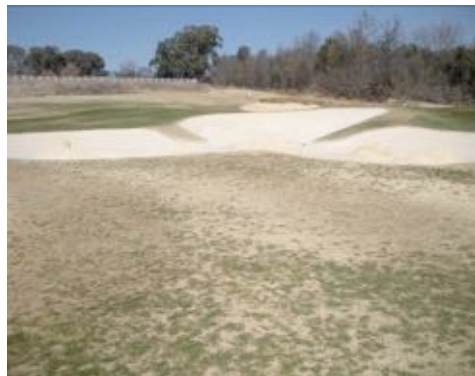
During Bunkertac™ application