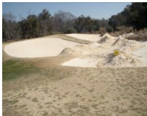
During Bunkertac™ application