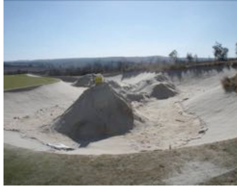
During Bunkertac™ application