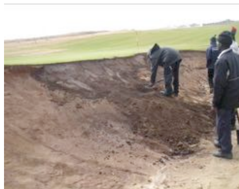
Bowling and reshaping