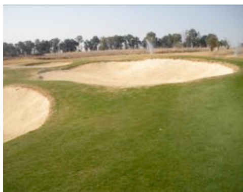
Before Bunkertac™ application