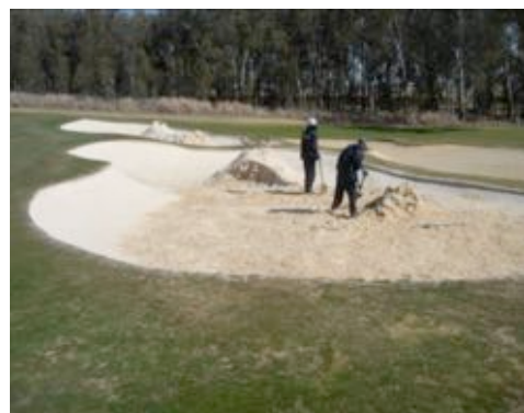
After Bunkertac™ application

The use of Bunkertac™ completely eliminates the possibility of any exposed fabric or nails visible to the golfer as it is in liquid form, not a geo-synthetic liner.