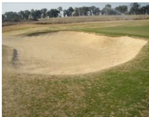
Before Bunkertac™ application