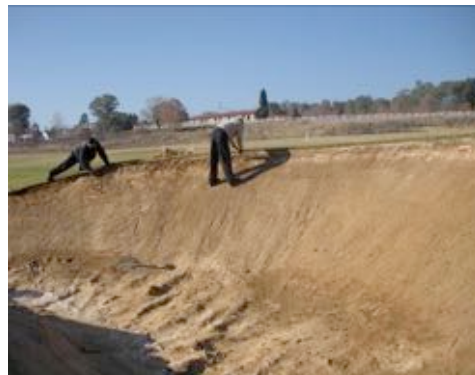
Cutting of roots