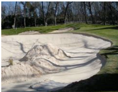
During Bunkertac™ application