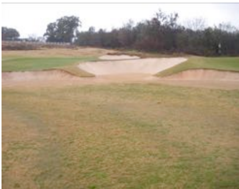
Before Bunkertac™ application