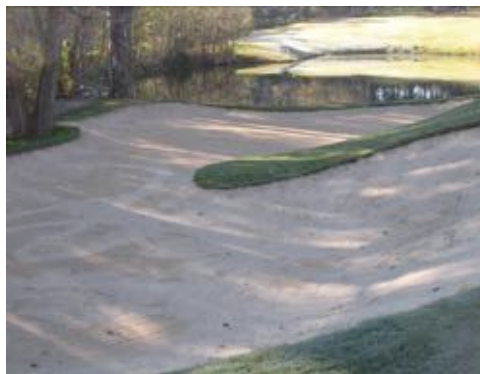
Before Bunkertac™ application