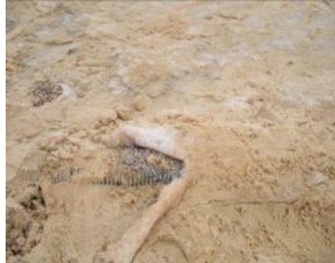
Exposed drainage pipe