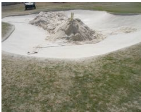
During Bunkertac™ application