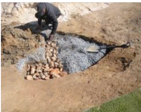
Installation of subterranean gabion