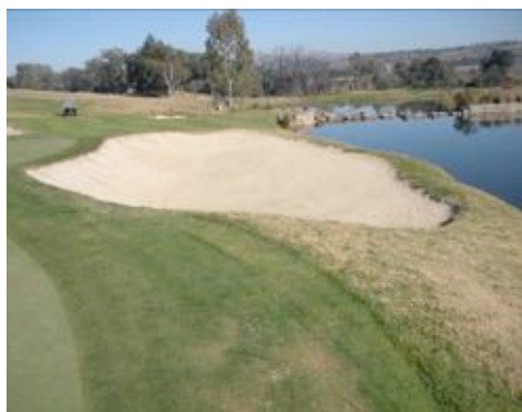
Before Bunkertac™ application