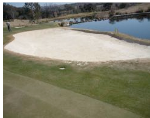
After Bunkertac™ application

The Bunkertac™ application began with pre-wetting of the bunker using a hosepipe to moisten and loosen the tension of the soil, a pre-coat of Bunkertac™ only followed by six coats of Bunkertac™ and sand.