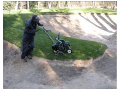
Re-definition of bunker edge