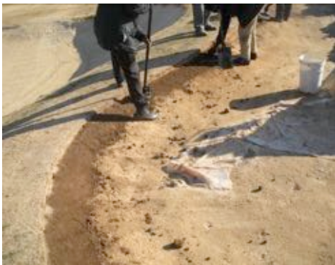
Compaction of top soil