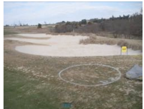
After Bunkertac™ application

As each coat of Bunkertac™ was applied sand was dusted over the treated area using a knapsack type duster blower in order to force sand into and covering the entire edge of the bunker up to the grass line and to ensure a nice looking smooth finish over the entire treated area. This method of sand flashing is the most effective and technologically advanced and the resulting improved aesthetics are sure to impress every golfer that plays the course.