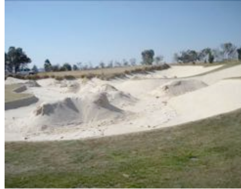
During Bunkertac™ application