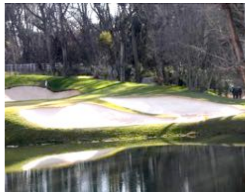
After Bunkertac™ application

For successful application of Bunkertac™ the proper preparation of the bunker to be treated is essential. Proper bowling and shaping of the bunker will lessen the amount of water run-off coming into the bunker. One of the benefits of using Bunkertac™ is that even with considerable amounts of water run-off contamination of the sand is eliminated or minimal even over the steepest of slopes.