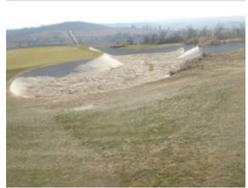
After Bunkertac™ application