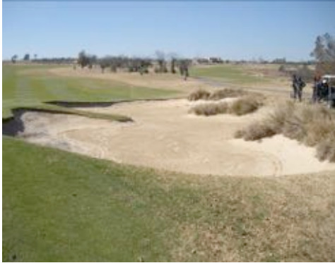
Before Bunkertac™ application