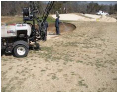
Spraying of Round Up