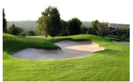
Bunker 18 #2 open for play