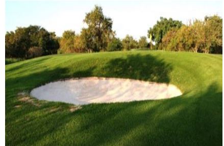
Bunker 8 open for play