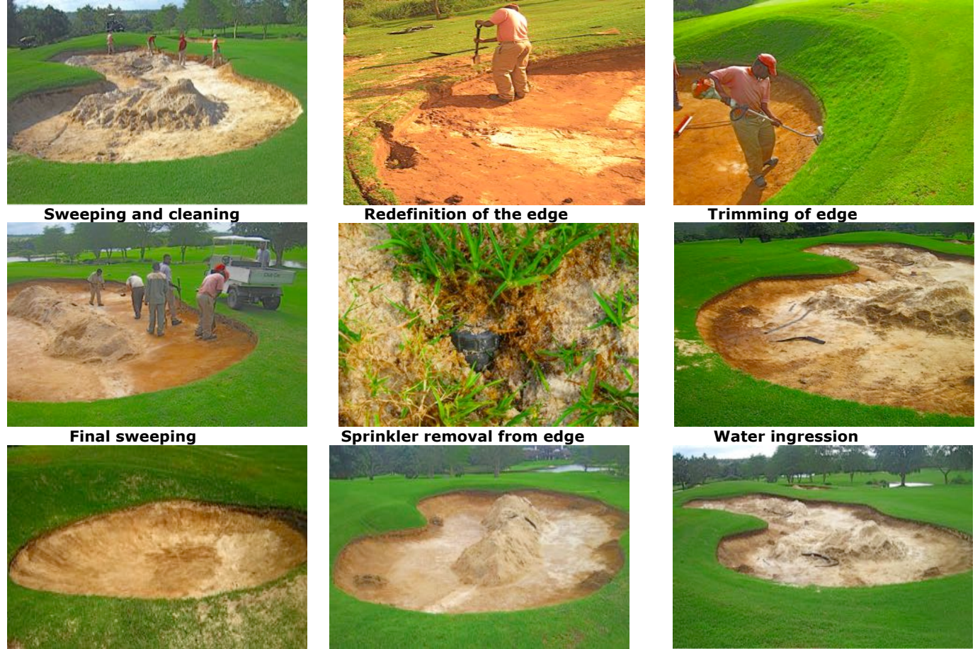
Hole 8 Bunker Prepared