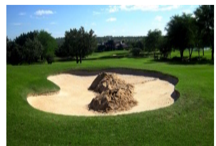
Bunker 18 #1 complete