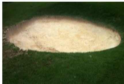
Bunker 8 complete

Using Bunkertac<sup>™</sup> and the application methods developed by On-Course Solutions for stabilization of the edge and face of the bunker, sand flashing and contamination prevention will provide you with not only a more aesthetically pleasing look to your bunkers but improved playability as well as a reduced impact upon the environment.