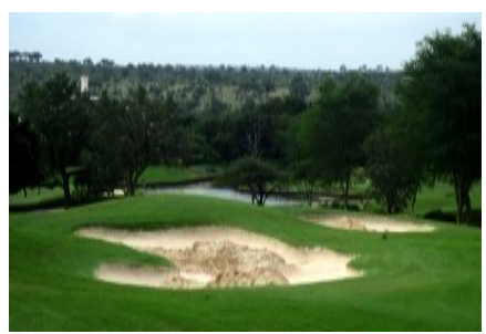
Bunker 18 #2 complete