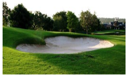
Bunker 18 #1 open for play On-Course Solutions Leopard Creek Bunkertac<sup>™</sup> Application April 2010